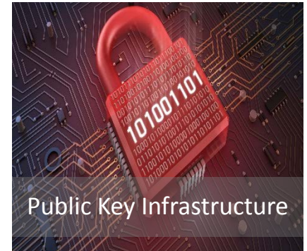
Public Key Infrastructure