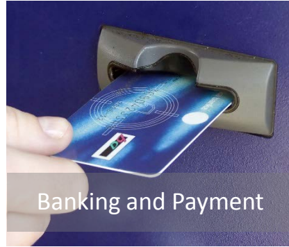
Banking and Payment