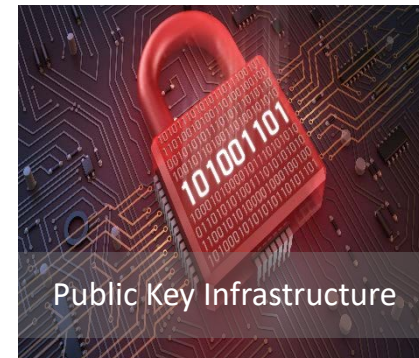
Public Key Infrastructure